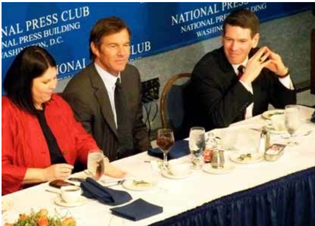
Quaid prepares to speak