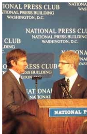
Quaid takes questions from the audience, read by Bjerga